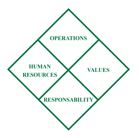
Figure 1. OVHR-Model for public service organizations (figure developed by the authors)

Operations : public service organizations (PSOs) should manage their financial and human resources in a sustainable way, they should use sustainable practices in their own operations to improve quality services for the public.